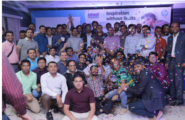
Joyous moment of Smart HP team amount others