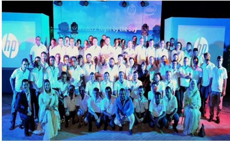
Winners Night by the Bay organized by HP