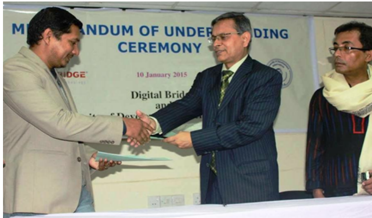
MOU signing ceremony between Digital Bridge and University of Development Alternative