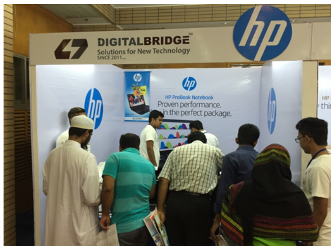
Digital Bridge in the Laptop fair at BICC