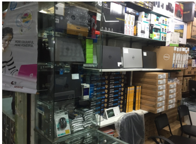
A snapshot of Digital Bridge outlet at Multiplan Center