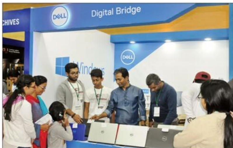
Visitors browse laptops at a stall styled 'Digital Bridge' in a fair organised by Expo Maker at Bangabandhu International Conference Centre in Dhaka on Saturday.