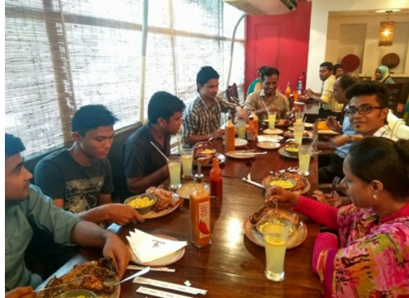
Digital Bridge Team at a get-together in a restaurant