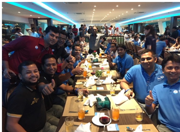
Partner Celebration at Bangkok Organized by DELL Bangladesh